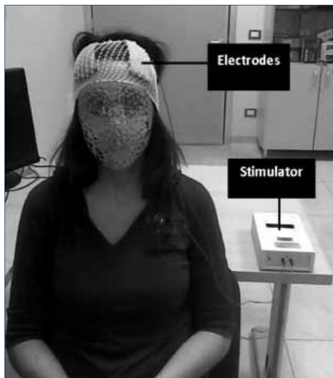
FIGURE 1. Representation of the main tDCS components. Rappresentazione dei principali componenti della tDCS.

ducted a two-week, parallel-group, double-blind, randomized clinical trial in 40 drug-free patients with MD. Study design included two active modalities of tDCS (DLPFC and occipital) vs. sham and the active stimulation over the DLPFC was found to be of largest benefit with overall good tolerability. Of note, antidepressant effects were maintained for one month after the end of treatment 24 . A subsequent case-report showed only modest improvement of depressive symptoms with 4 weeks of augmentative anodal tDCS over DLPFC in a patient with TRD 25 . Subsequently, however, an open-label trial with twice-daily tDCS over the DLPFC for five days found a significant improvement of depressive symptoms with favourable tolerability in 14 patients with TRD and high suicide risk 26 . A recent double-blind sham-controlled trial conducted with 40 depressed subjects reported a significant improvement of depression scores over 10 tDCS sessions (anodal stimulation centred over the left DLPFC, with the cathode placed on the lateral side of the contralateral orbit) with only minor side-effects. However, no between-group difference in the five-session, sham-controlled phase could be detected 27 . A recent study assessing differential efficacy of tDCS in unipolar (n = 14) vs. bipolar (n = 14) depressed subjects in a twice-daily, five-day open treatment – anodal electrode placed on the left prefrontal